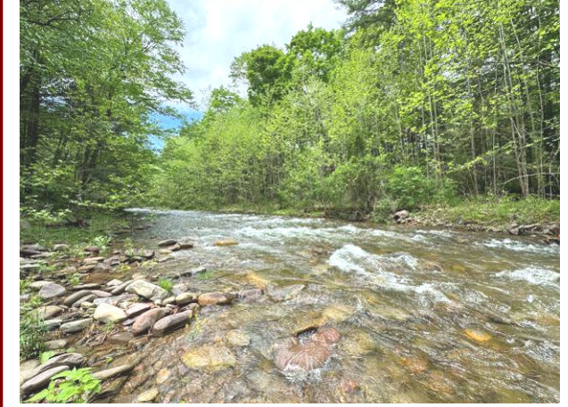
Lot borders Ramsey's Draft - known for Trout